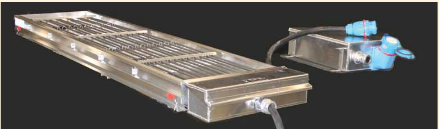
Spectrum BJX4-60 Heater with Quick Disconnect (60 kw = 204,780 btu's)

A typical heater systems consist of under car heaters mounted parallel inside and outside the tracks, and angled side and vertical side heaters mounted on stands, track connection boxes, track alarm, power distribution cabinets, master control cabinet and all associated engineering.